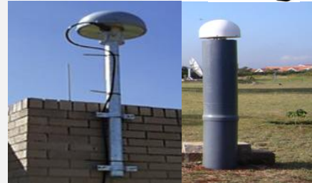
NTrip Server/Client CORS MANAGEMENT SOFTWARE

African Geodetic Reference Frame (AFREF) is a modern and uniform geodetic reference frame for Africa, fully consistent with the International Terrestrial Reference Frame (ITRF) and global coordinate systems to support national, regional and global applications in Africa including civil aviation, regional infrastructural development, Land administration and management, precision & commercial farming, weather forecast, and other earth science studies. AFREF is composed of a network of Continuously Operating Reference Stations (CORS) using Global Navigation Satellite Systems (GNSS) technologies. AFREF data and products are freely available and are being used in various positioning applications with positioning accuracy of sub meter to millimeter levels.